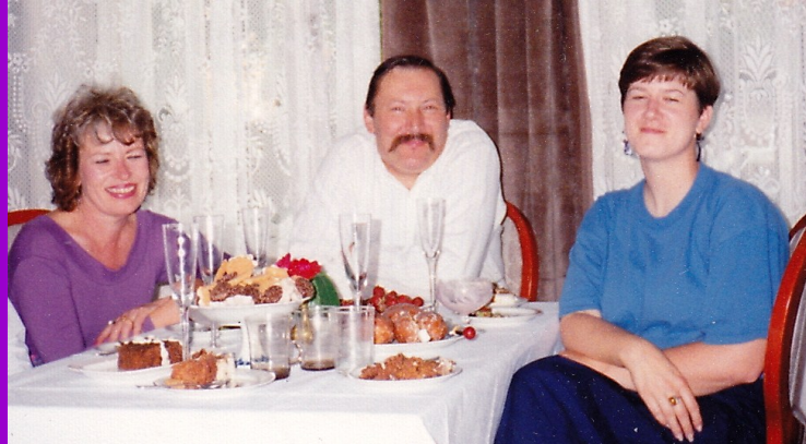
1991 in Poland with Mom who was in Peace Corps