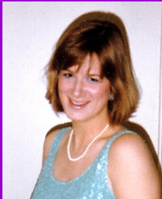
Harvard Co-Ed, 1984