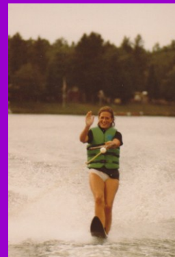
Sailing & Water Skiing in Minnesota