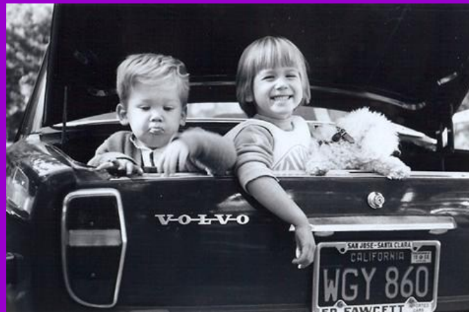
1968: Driving to Minnesota