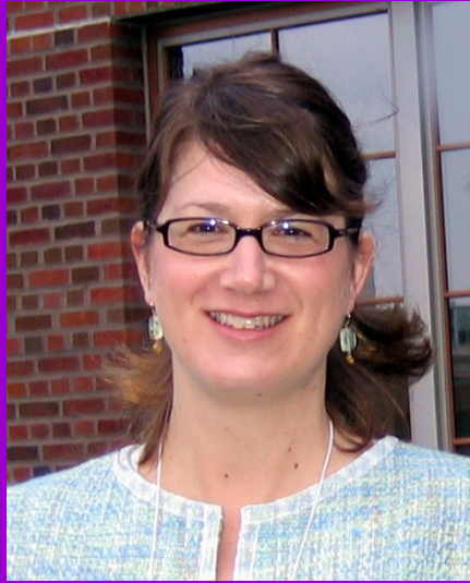
Speaking at Dad's Retirement Party, 2005