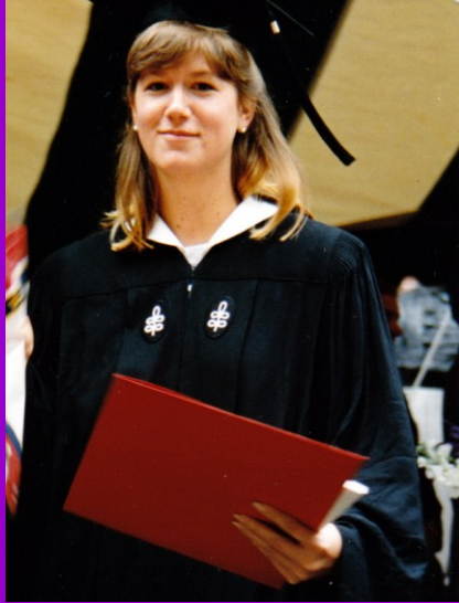
Harvard Grad Cum Laude 1988