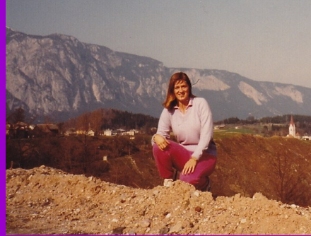
Year in Italy as Exchange Student, 82-83