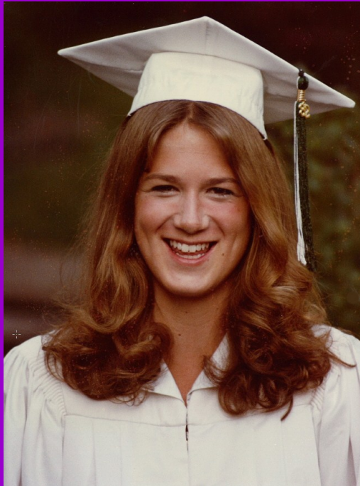
Edina High Graduation 1982