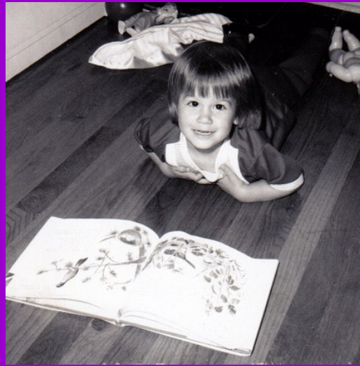
Reading on her Second Birthday